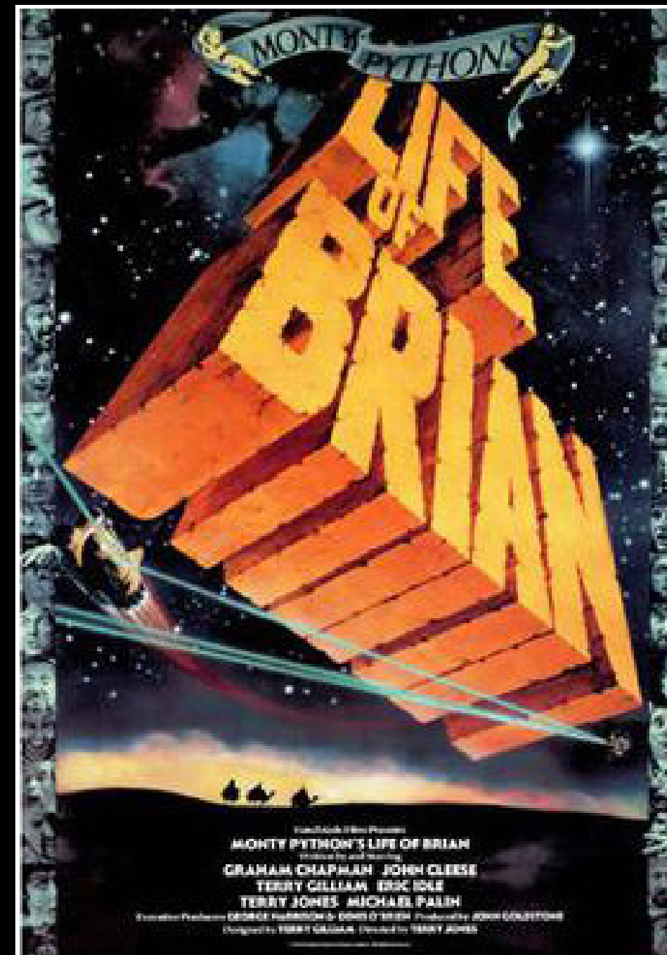
Monty Python's Life of Brian