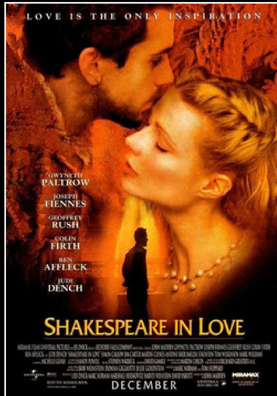
Shakespeare in Love